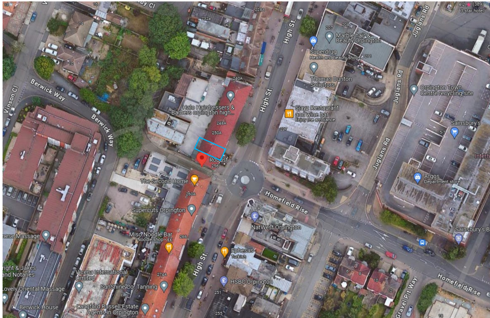
Satellite Image of SJayz, 254 High street Orpington BR6 0LZ